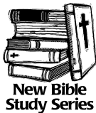
New Bible Study Series