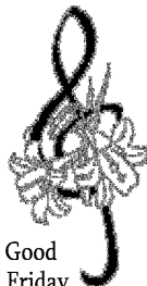
Good Friday Music