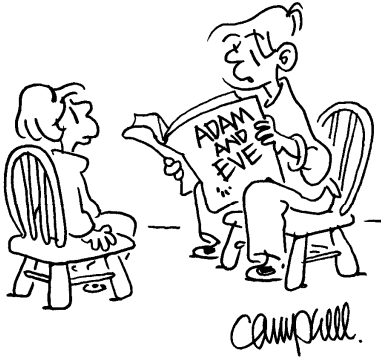
"They joined the Fruit-of-the-Month Club, and everything was fine 'til they got to apple."