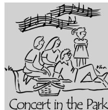
Concert in the Park